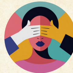
Wolfgang Amadeus Mozart COSÌ FAN TUTTE