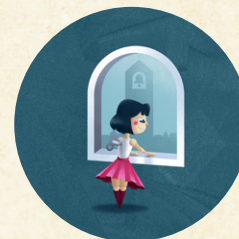
Dace Radina / Léo Delibes LITTLE COPPÉLIA (world premiere)