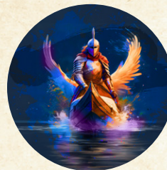
Richard Wagner LOHENGRIIN