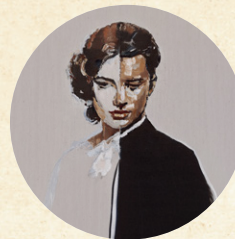
Ludwig van Beethoven FIDELIO